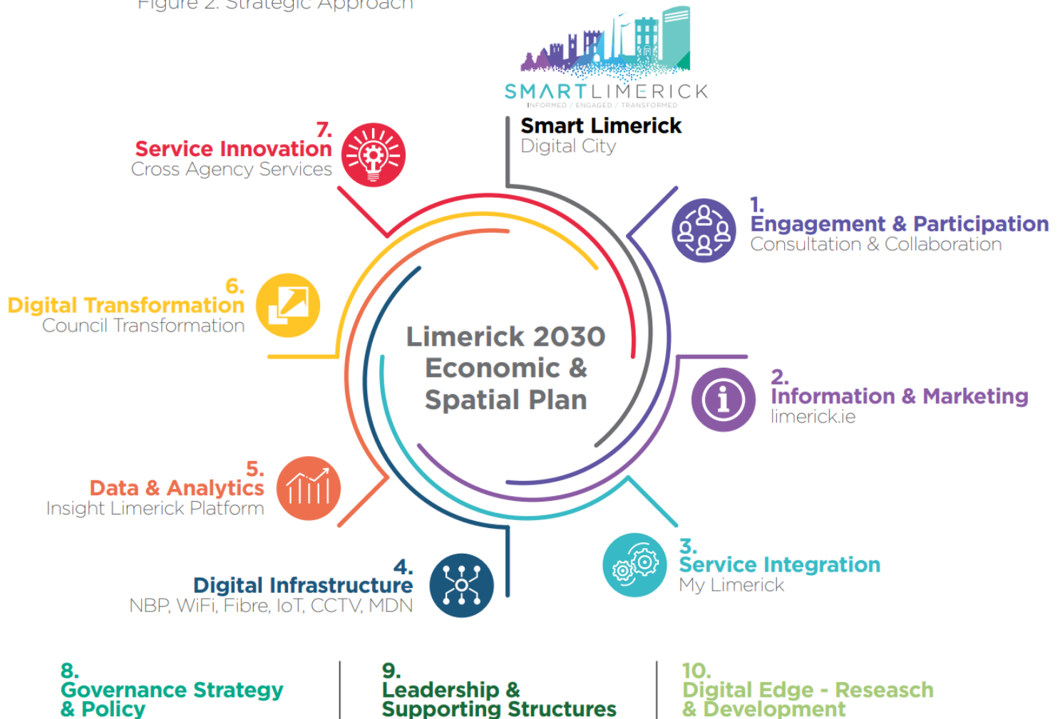
Figure 2: Strategic Approach

Smart Limerick means 10 Programmes 125 Projects – Here is a flavour of the projects being undertaken right now in Limerick.