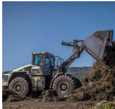
Volvo LX1 - Electric