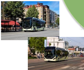
2 new bus types: Electric Hybrid Fully Electric