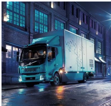
Volvo FL - Electric