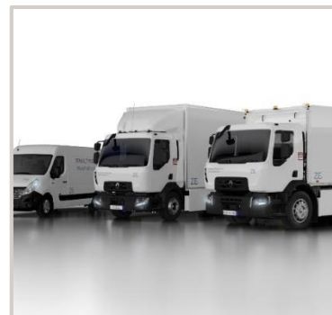
Renault Trucks Z.E - Electric