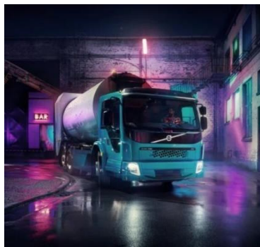
Volvo FE - Electric