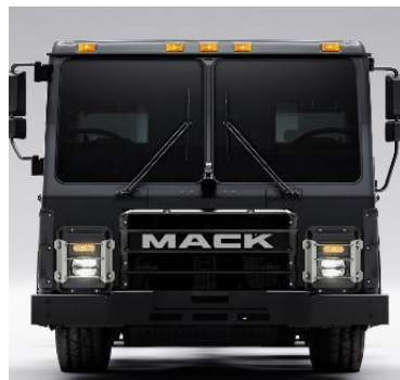
Mack LR Waste - Electric