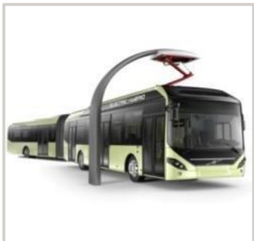
Articulated Volvo Bus - Electric