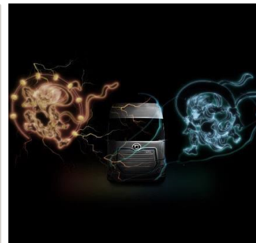
UD Quon Vision - Electric