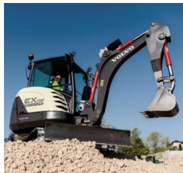
Volvo EX2 - Electric