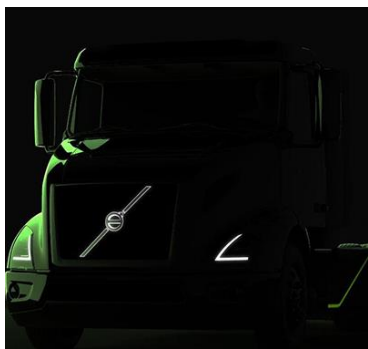
VNR - Electric